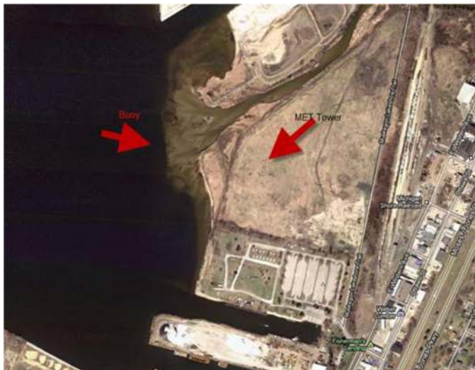
Figure 3. Location of the met mast and WindSentinel buoy in Muskegon Lake, Michigan, USA.

Grand Valley took possession of the WindSentinel buoy in September 2011 and deployed it in Muskegon Lake from 7 October 2011 to 3 November 2011. The buoy was positioned about 400 m offshore from a 50 m onshore met mast at the east end of the Muskegon Lake (Figure 3). The location of each sensor was as follows: