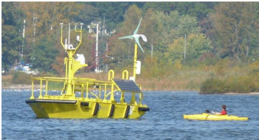
Figure 1: The wind monitoring buoy on site in Muskegon Lake. The egg-shaped device mounted above the deck is the Vindicator laser wind sensor. The kayak offers a sense of scale.

The array of sensors aboard the WindSentinel requires a substantial power supply. The buoy is powered by a redundant system of solar panels, a small wind turbine, and a diesel generator, all of which are integrated into a battery bank [11] (Figure 1).